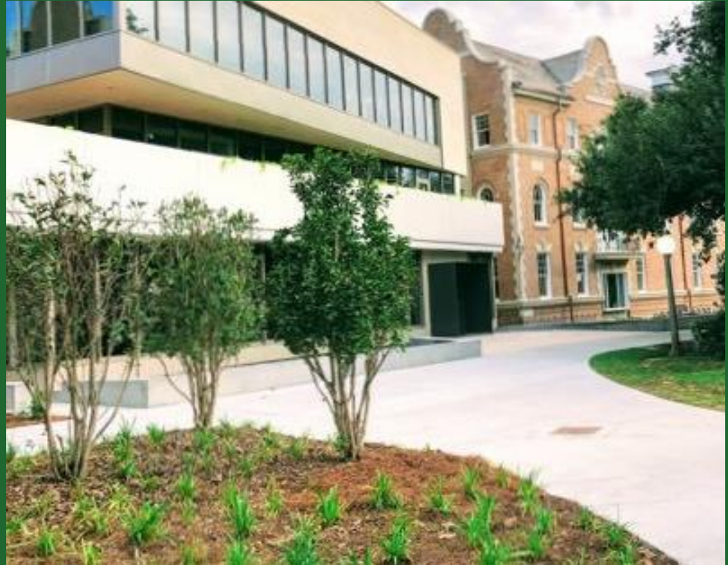
Mussafer Hall – NTC Advising, Career, Success